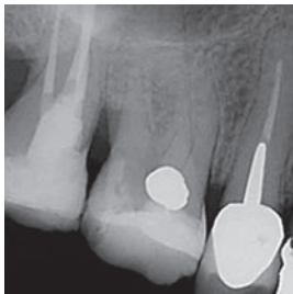
Pre-operation Diagnosis: pulpitis