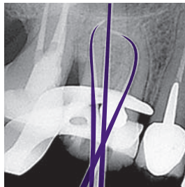
Difficulty: Narrow, calcified