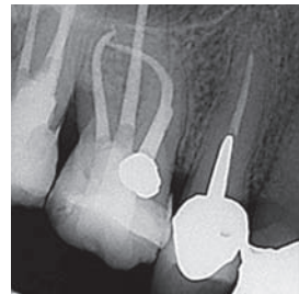
Post-operation MB & DB - 35/.04 P - 50/.04